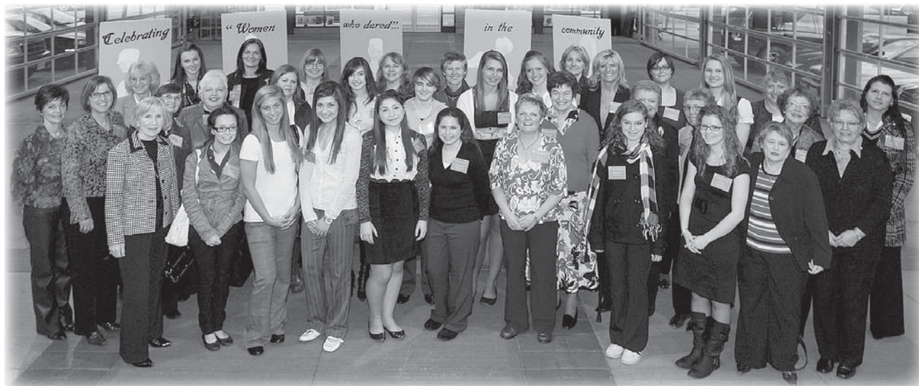
Women of Distinction nominee's photo taken at Market Square during the Nominee's Reception.

We hope with this communication tool we can reach a larger volume of committed donors dedicated to empowering women and women led families.